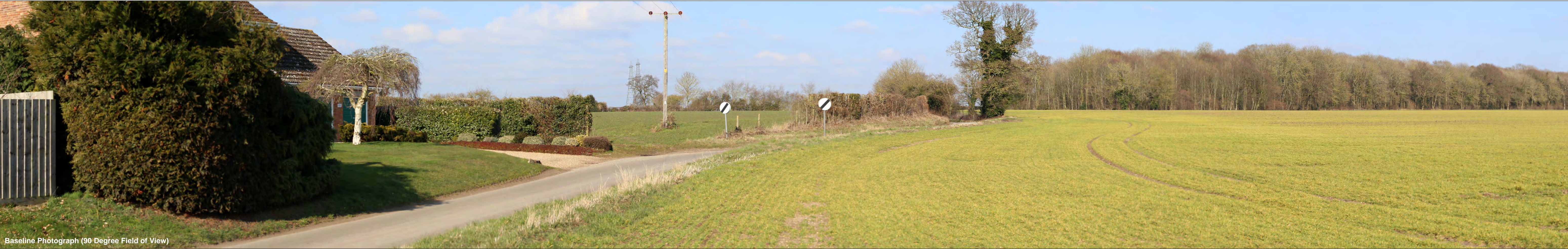
Baseline Photograph (90 Degree Field of View)