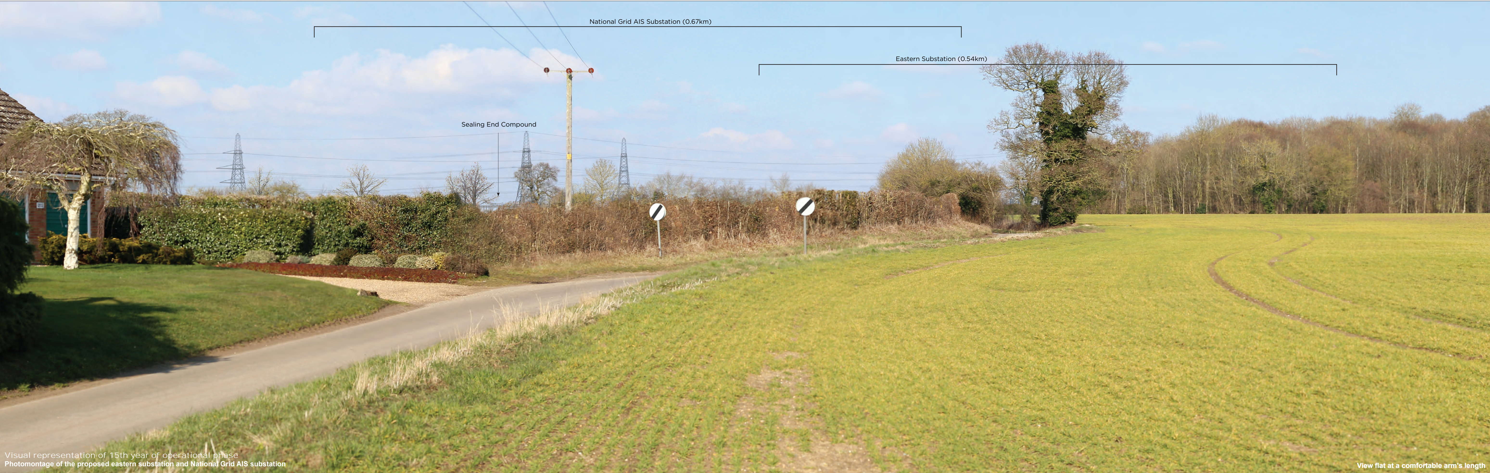
Visual representation of 15th year of operational phase Photomontage of the proposed eastern substation and National Grid AIS substation