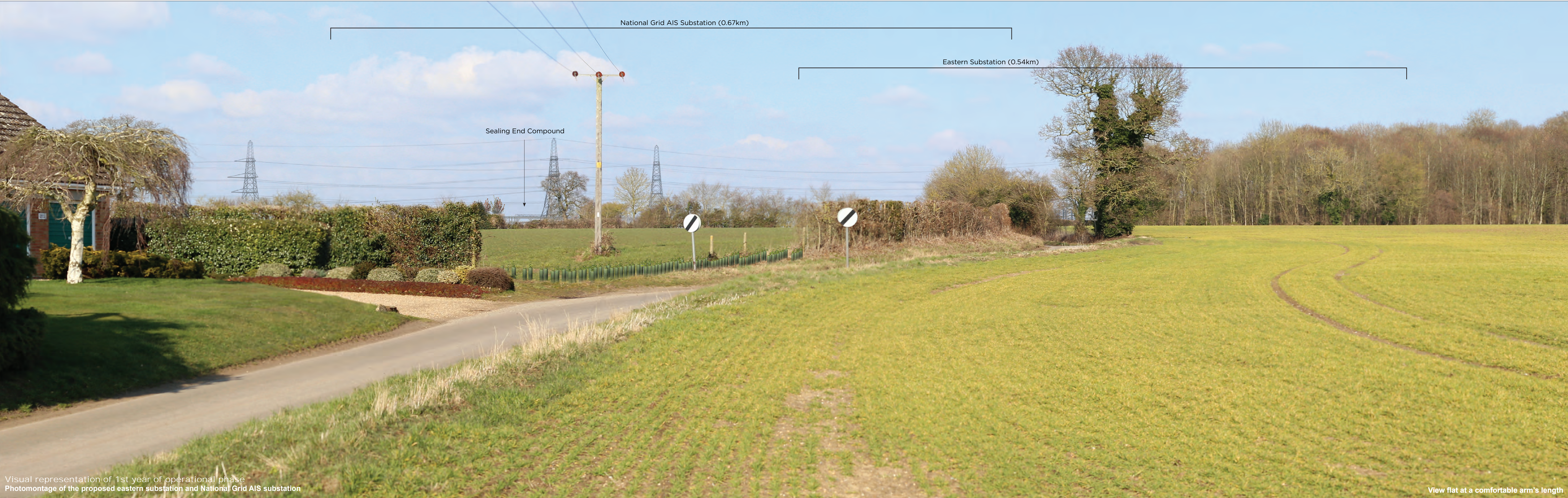
Visual representation of 1st year of operational phase Photomontage of the proposed eastern substation and National Grid AIS substation