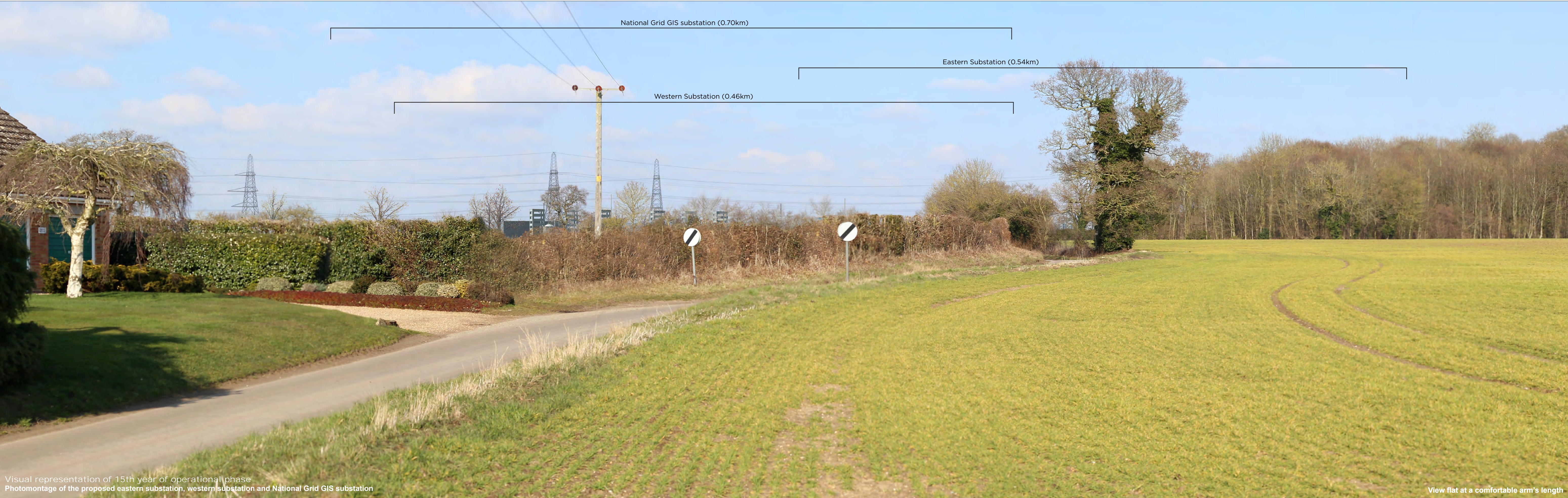
Visual representation of 15th year of operational phase Photomontage of the proposed eastern substation, western substation and National Grid GIS substation