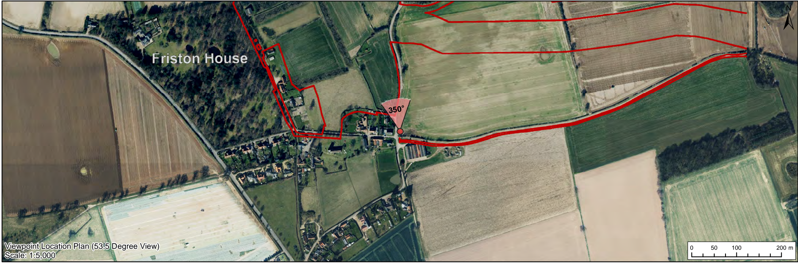
Viewpoint Location Plan (53.5 Degree View) Scale: 1:5,000