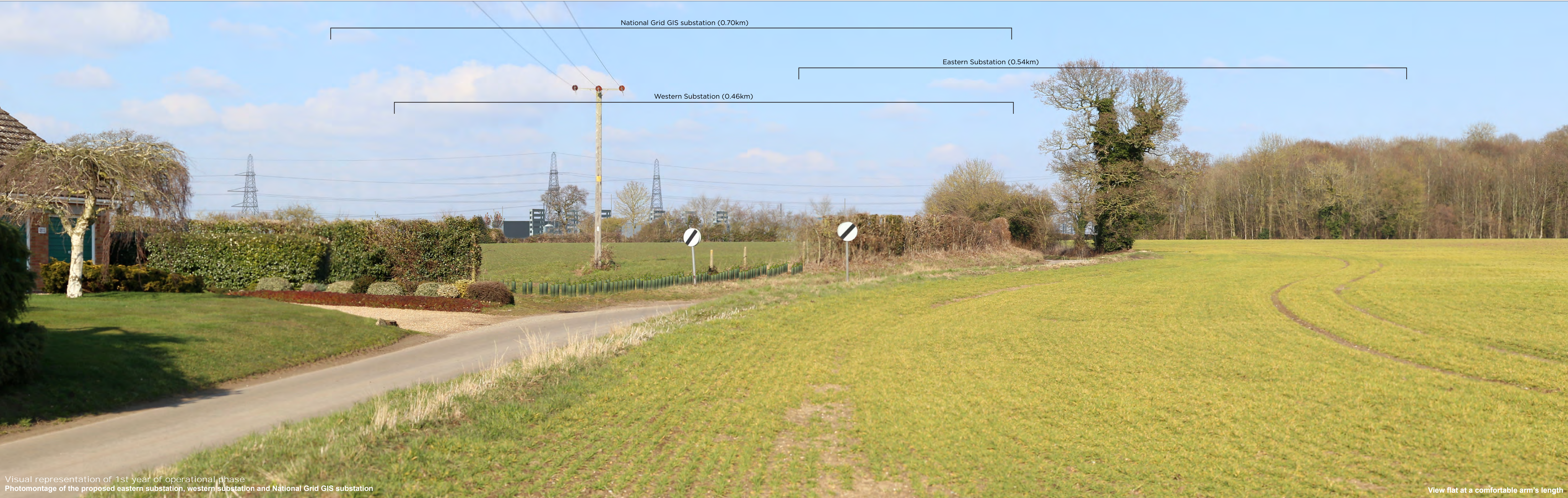
Visual representation of 1st year of operational phase Photomontage of the proposed eastern substation, western substation and National Grid GIS substation